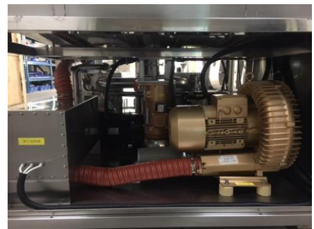
Pump High pressure,high flow,electric