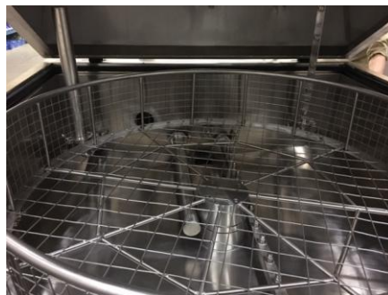
Cleaning Basket Auto(Cleaning,Rinsing,Drying)