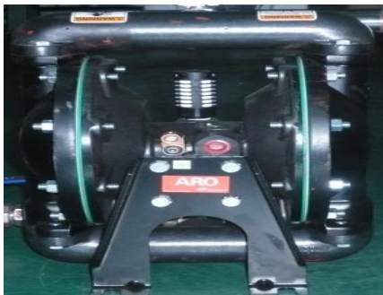
Diaphragm pump USA—INGERSORAND